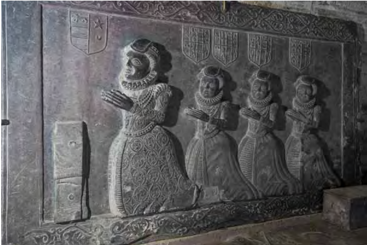
Slate Memorial at St Tudy