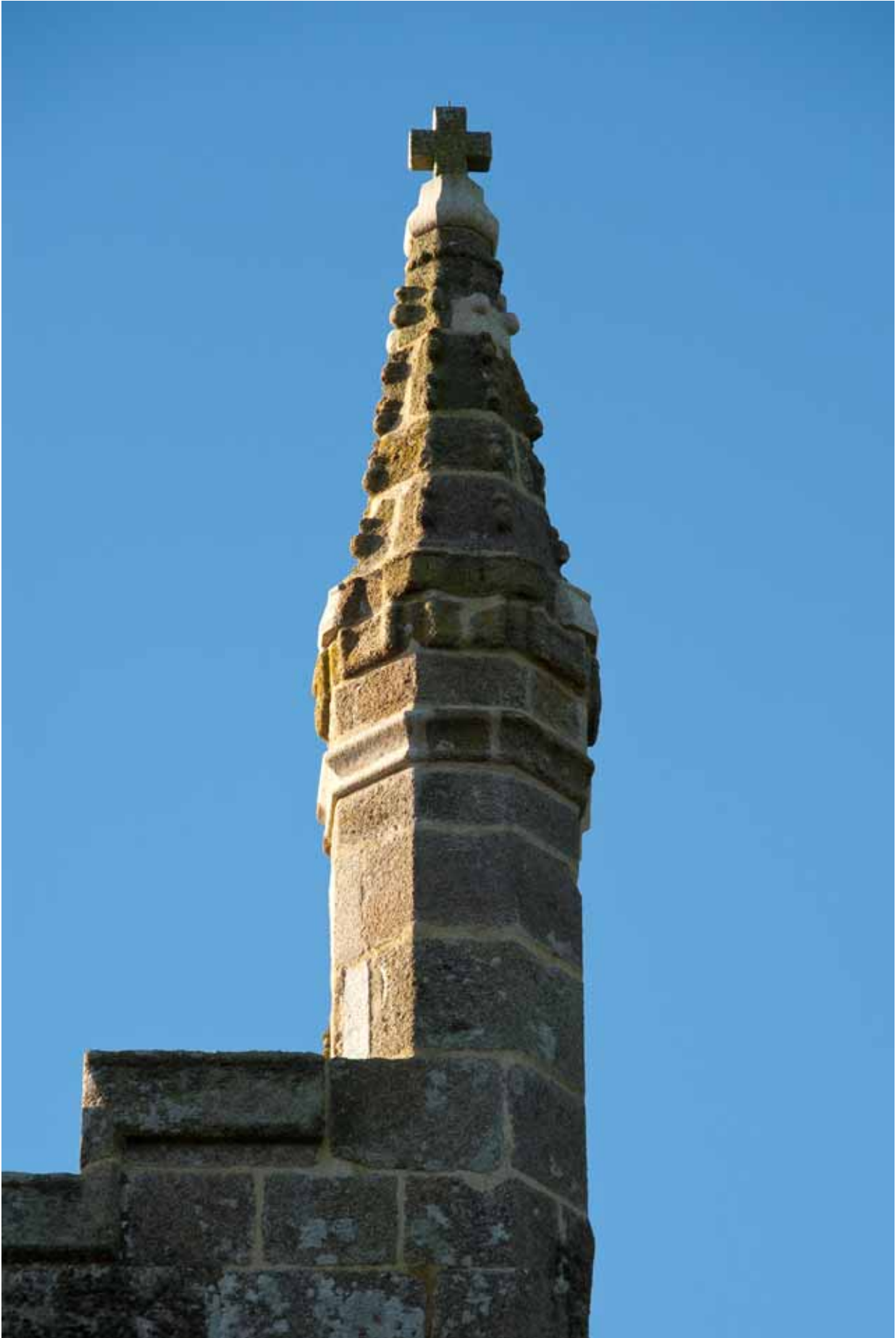
Pillaton Church (Detail of Pinnacle) Friends Visit Wednesday 14th May 2014