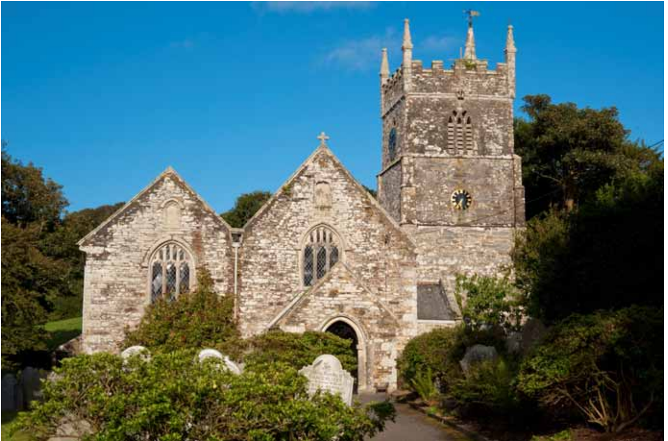
Veryan Church: Grant of £4,000 made in March 2014