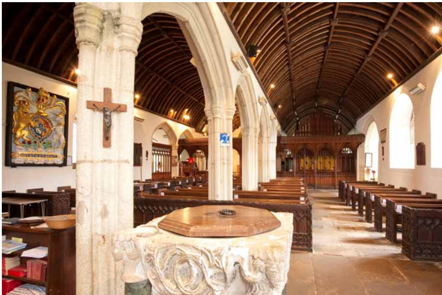
St Newlyn East (2013 Annual General Meeting)