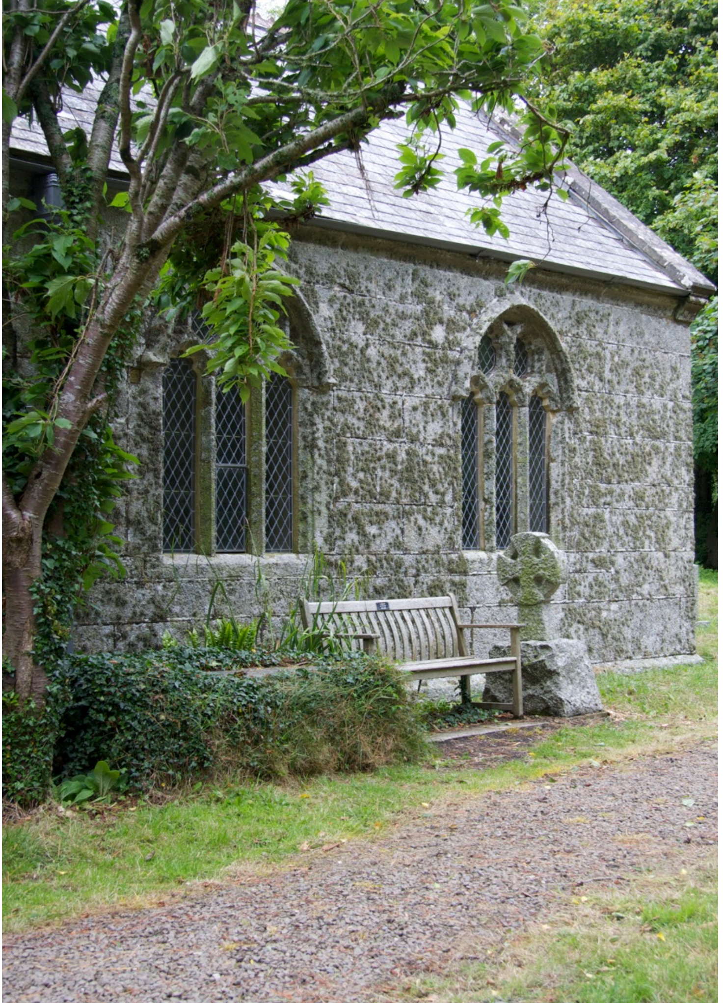
St Juliot Church